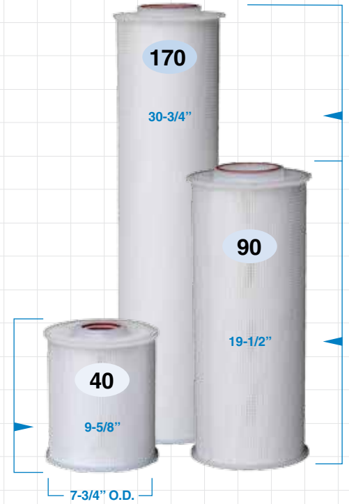
Hurricane® All-Poly Cartridges