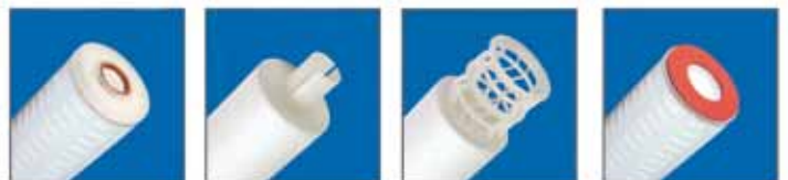
213 (internal o-ring) PP Core Ext. Spring DOE (double open end)

Note: This publication is to be used as a guide. The data within has been obtained from many sources and is considered to be accurate. Harmsco does not assume liability for the accuracy and/or completeness of this data. Changes to the data can be made without notification. Temperature, Pressure, Flow Rates, Differential Pressures, Chemical Combinations and other unknown factors can affect performance in unknown ways. Limited Warranty: Harmsco warrants their products to be free of material and workmanship defects. Determination of suitability of Harmsco products for uses and applications contemplated by Buyer shall be the sole responsibility of Buyer. The end user/installer/buyer shall be liable for the product's performance and suitability regarding their specific intended applications. End users should perform their own tests to determine suitability for each application.