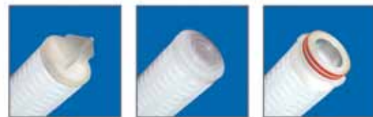
Fin Flat Cap 226 (w/SS insert)