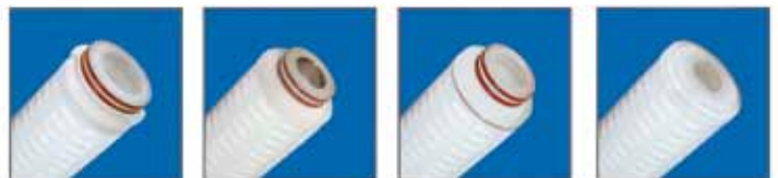
226 222 (w/SS insert) 222 Flat Cap