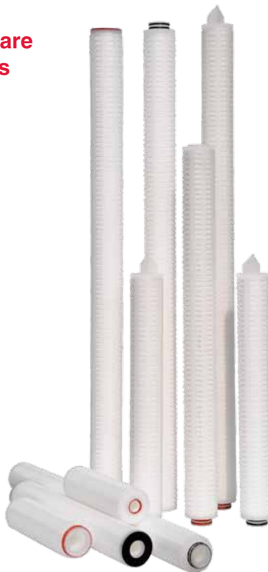
Pleated Hydrophilic Polysulfone Membrane Cartridges