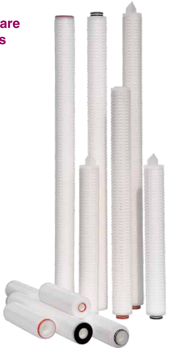
Pleated Hydrophilic Polyethersulfone Membrane Cartridges