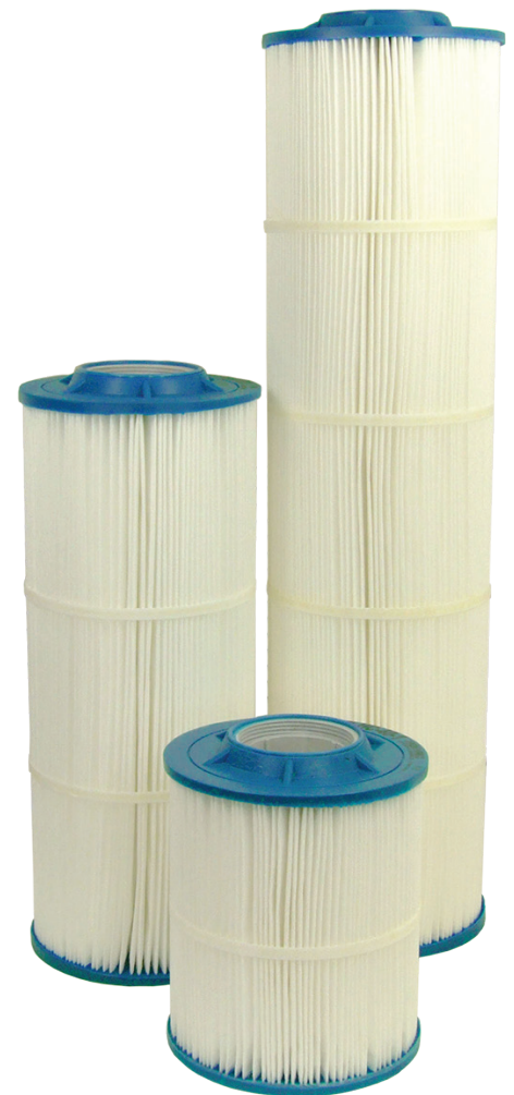
Premium Hurricane® Polyester Cartridges