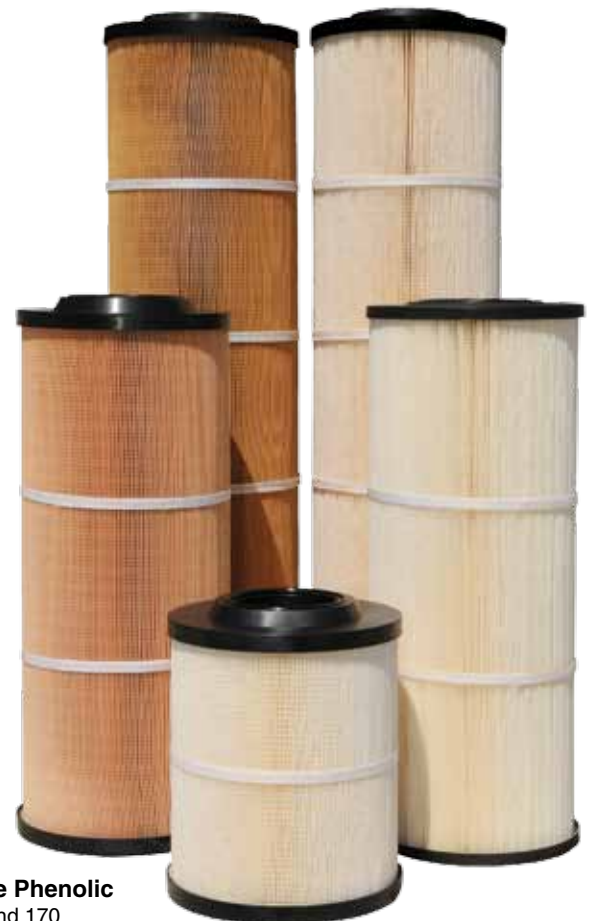
Cellulose Phenolic 90 and 170