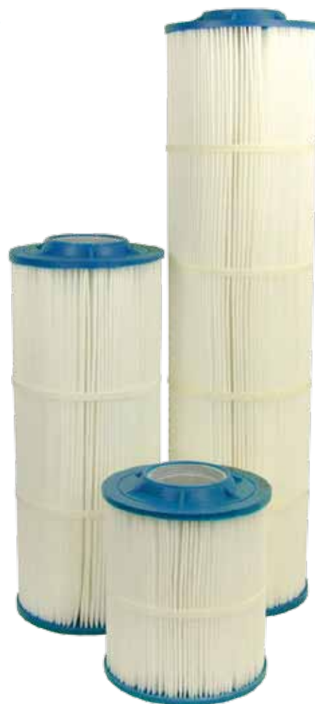
Premium Hurricane® Harmsco-Free Cartridges